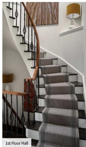
1st Floor Hall

The basement kitchen was provided by Edinburgh-based Peden and Pringle. It followed the basic footprint of the existing kitchen but modernized and increased storage and specification – a double doored larder is a convenient and stylish feature, while the painted cabinets in Farrow and Ball's Studio Green continue the deep earthy tones in the rest of the house. While the colours are rich and deep, clever lighting, patterned fabrics, and