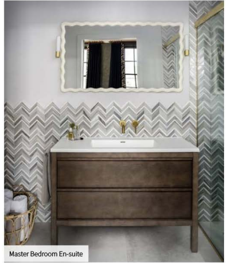
Master Bedroom En-suite

This project moved quickly. From first meeting to installation was a mere nine months, but this was achieved by excellent communication, drive, and vision between the client and designer. The result is striking – from a pristine Georgian façade, you are welcomed into a rich, enveloping home with a tailored yet accumulated feel where everything just... works.