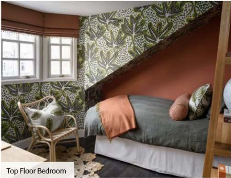
Top Floor Bedroom

Kimberley adores the bedroom and the finishing touches that serve to take it over the edge into pure luxury. The fringed Dedar trim round the headboard, the patterned trim and lining on the curtains, and the silk inlays in the drawers are all special touches, while the Porta Romana ceiling light finishes the room beautifully.